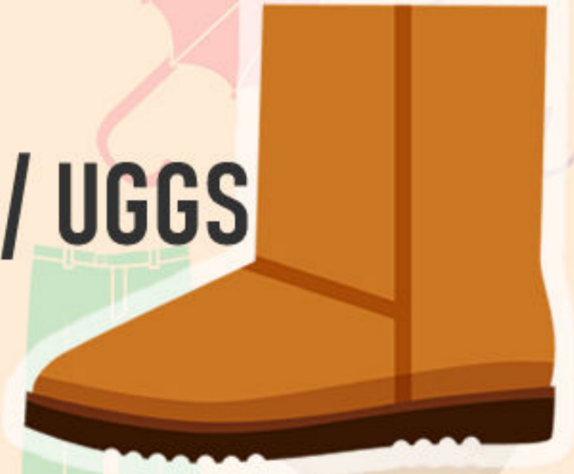
BOOTS / UGGS