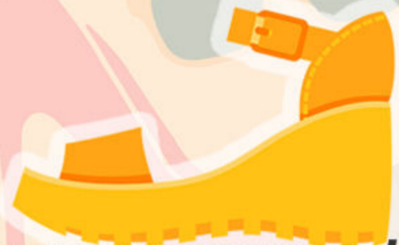
PLATFORM SHOES / WEDGE