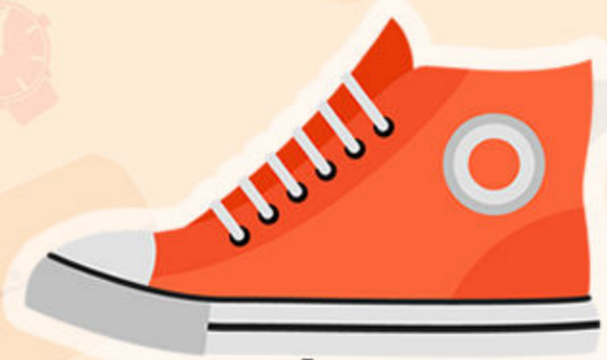
TRAINERS / CONVERSE