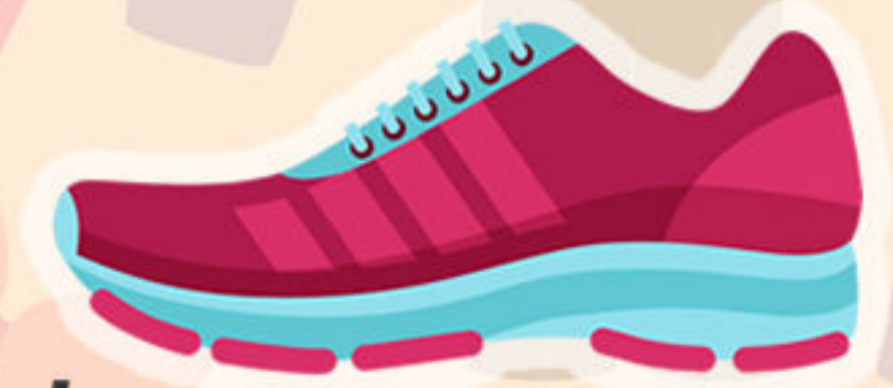
TRAINERS / RUNNING SHOES