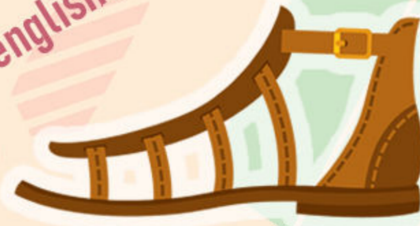
GLADIATORS / SANDALS